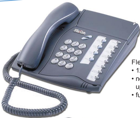
FlexSet 120 • 12 buttons • no display (120 upgrades to 120D) • full speakerphone

and ensures you will be ready for the communications demands of tomorrow.