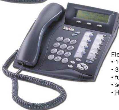
FlexSet 120S • 10 buttons • 3 x 24 LCD • full speakerphone • soft-key operation • HDF support