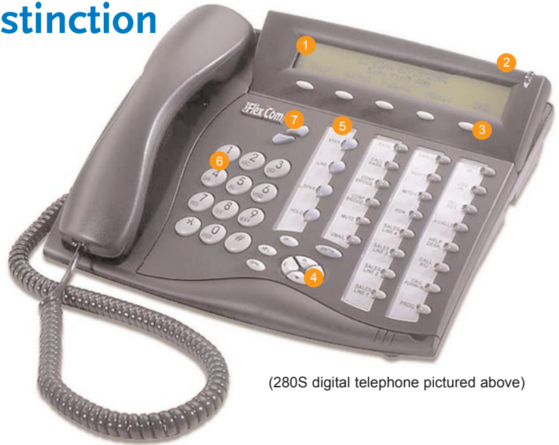
(280S digital telephone pictured above)

Available in your choice of pearl white or charcoal grey, all Coral FlexSets come with four buttons configured system-wide for consistent operation. A system administrator or individual users can define remaining buttons as needed.