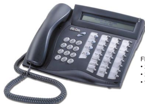
FlexSet 280D • 28 buttons • 2 x 40 LCD • full speakerphone