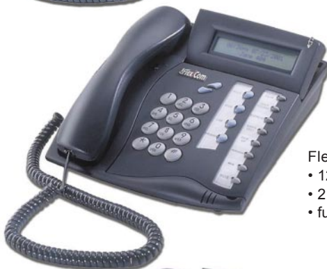
FlexSet 120D • 12 buttons • 2 x 24 LCD • full speakerphone